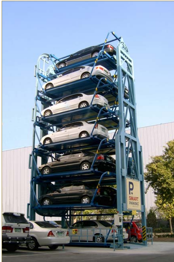
Project name Dohwadong Product SMART PARKING® Model & Q'ty 1 x SM12L Parking capacity 12 sedan cars Location Seoul, Korea