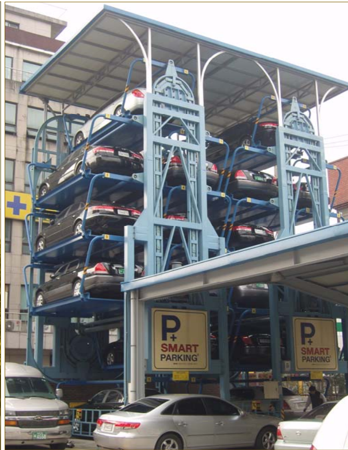
Project name Joy Rent Car Product SMART PARKING® Model & Q'ty 2 x SM10L Parking capacity 20 sedan cars Location Seoul, Korea