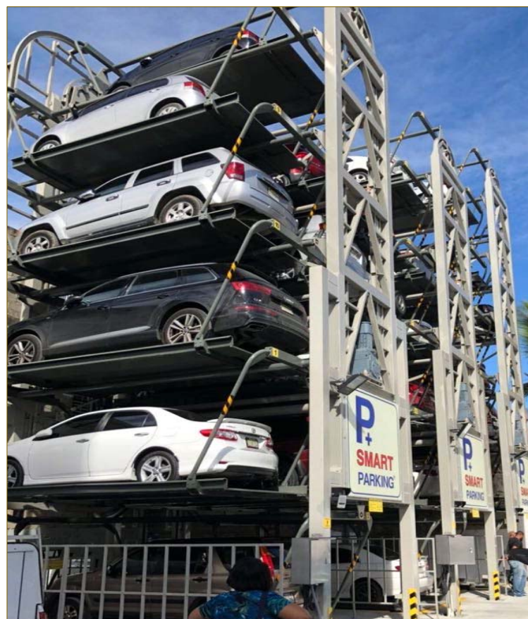
Project name Otorrino Hospital Product SMART PARKING® Model & Q'ty 2 x SM10SU & 1xSM12SU Parking capacity 32 SUVs Location Santo Domingo, Dominican Republic