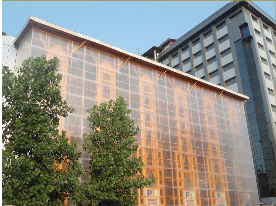
Project name Dana building Product SMART PARKING® Model & Q'ty 6 x SM16L Parking capacity 96 sedan cars Location Rasht city, Iran