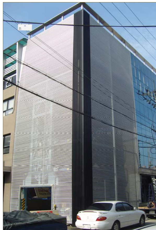
Project name Plus Design Product SMART PARKING® Model & Q'ty 1 x SM12L Parking capacity 12 sedan cars Location Seoul, Korea