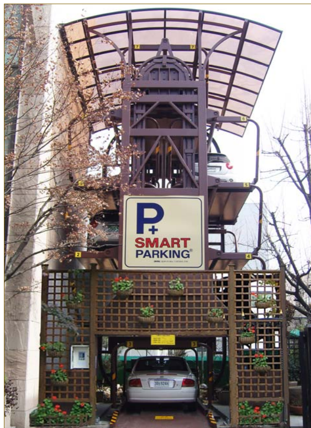
Project name Yohan Building Product SMART PARKING® Model & Q'ty 1 x SM8L Parking capacity 8 sedan cars Location Seoul, Korea