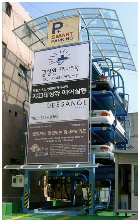
Project name Hana bank, Abgujung Product SMART PARKING® Model & Q'ty 1 x SM8L Parking capacity 8 sedan cars Location Seoul, Korea