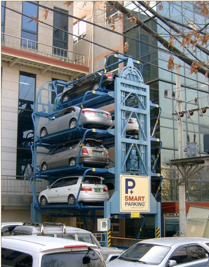
Project name Pyunghwa Building Product SMART PARKING® Model & Q'ty 1 x SM8L Parking capacity 8 sedan cars Location Seoul, Korea