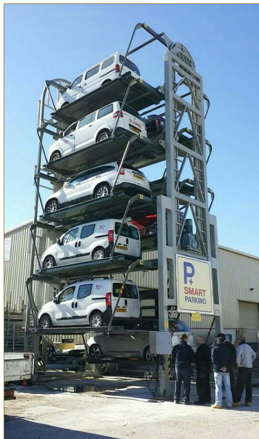
Project name GJBS head center Product SMART PARKING® Model & Q'ty 1 x SM10SU Parking capacity 10 SUVs Location Gibraltar, UK