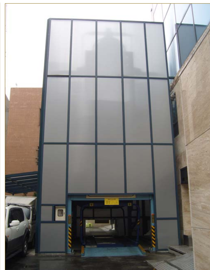
Project name Woori Building Product SMART PARKING® Model & Q'ty 1 x SM8L Parking capacity 8 sedan cars Location Seoul, Korea