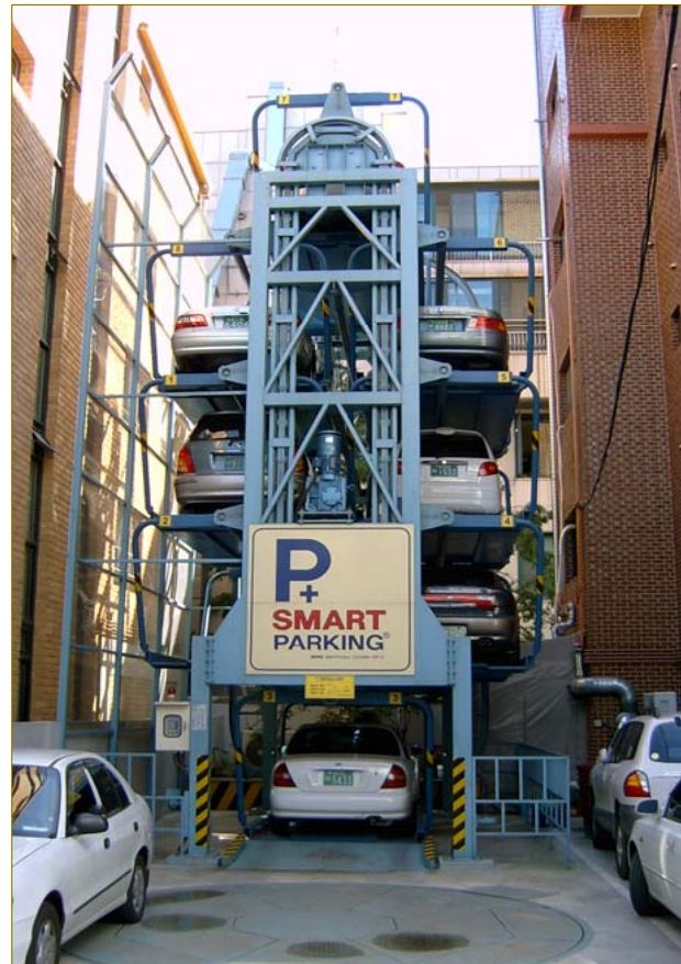
Project name Hyanhnamu Building Product SMART PARKING® Model & Q'ty 1 x SM8L Parking capacity 8 sedan cars Location Seoul, Korea