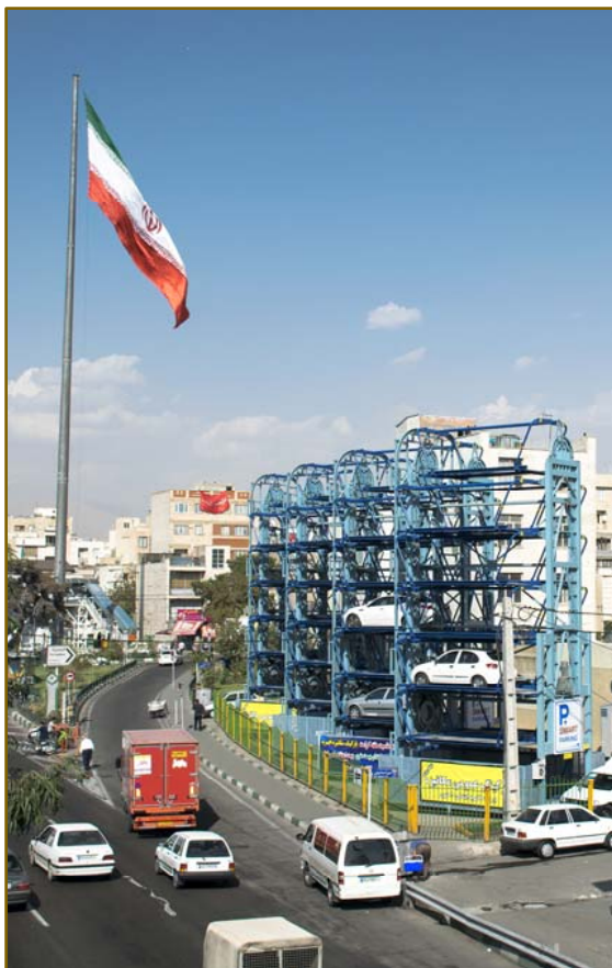
Project name DSC 0100 Product SMART PARKING® Model & Q'ty 4 x SM12L Parking capacity 48 parking lots Available car Sedan car Location Tehran, Iran