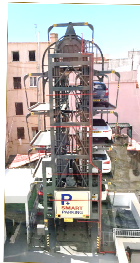
Project name Prime minister's office Product SMART PARKING® Model & Q'ty 1 x SM10SU Parking capacity 10 SUVs Location Gibraltar, UK