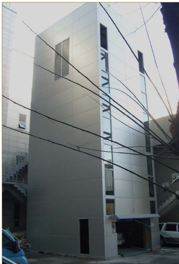
Project name Boram Hosital Product SMART PARKING® Model & Q'ty 1 x SM14L Parking capacity 14 sedan cars Location Incheon, Korea