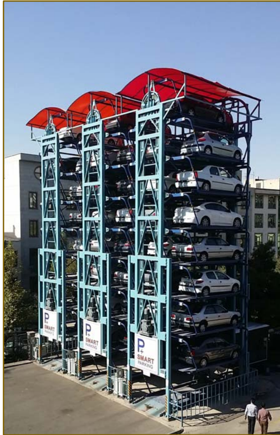
Project name District 2 municipality Product SMART PARKING® Model & Q'ty 3 x SM16L Parking capacity 48 sedan cars Location Dist 2, Tehran, Iran