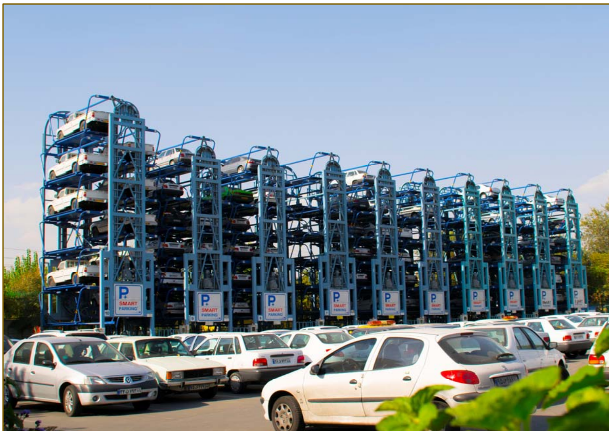
Project name District 15 Product SMART PARKING® Model & Q'ty 10 x SM12L Parking capacity 120 parking lots Available car Sedan car Location Tehran, Iran