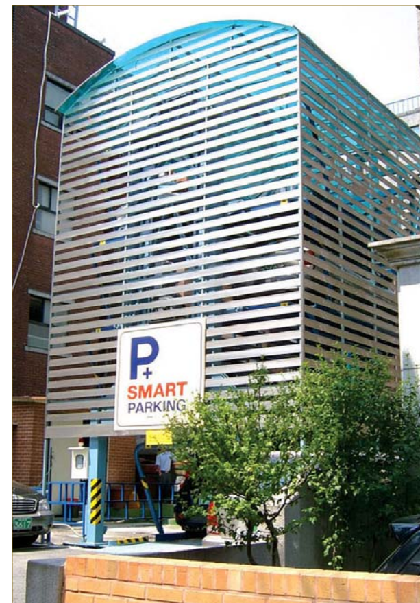
Project name AP Building Product SMART PARKING® Model & Q'ty 1 x SM8L Parking capacity 8 sedan cars Location Seoul, Korea