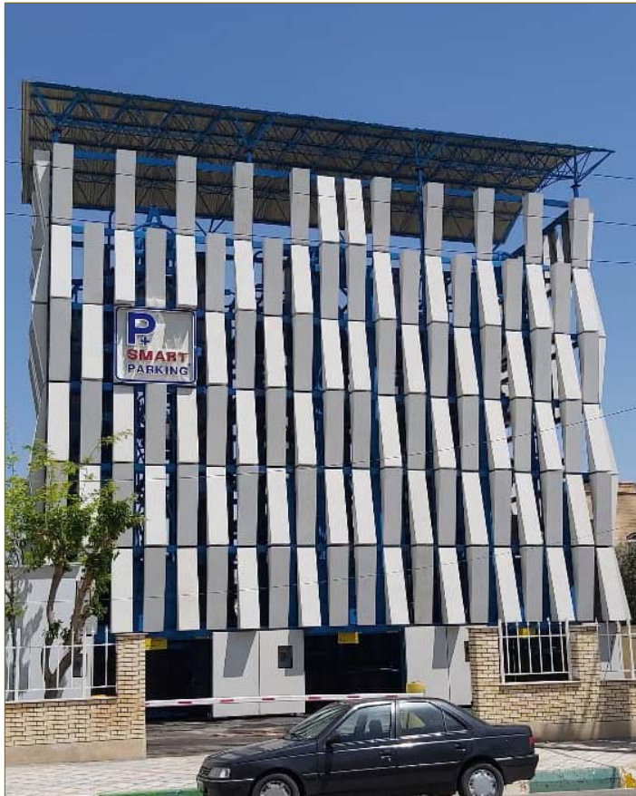
Project name Islamshahr town Product SMART PARKING® Model & Q'ty 3 x SM12L Parking capacity 36 sedan cars Location Tehran, Iran